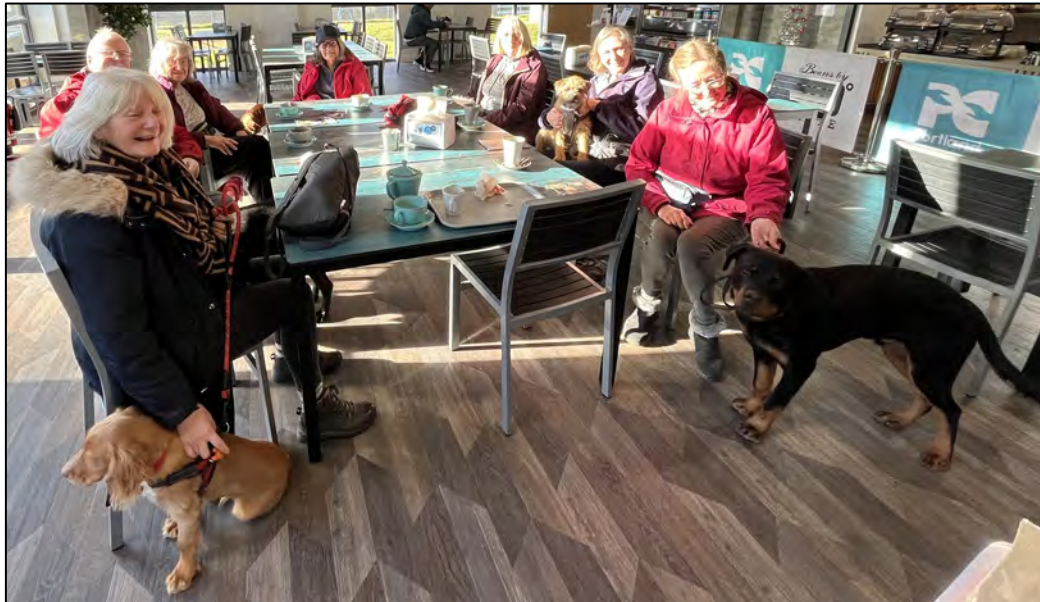
Dog Friends Members at Portland College Coffee Shop