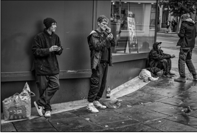
Nottingham streets in September, for the theme of Urban Photography

In the last couple of months, our Photography for Fun group, which generally meets on the 3 rd Tuesday afternoon each month, has been out on no less than three photoshoots.