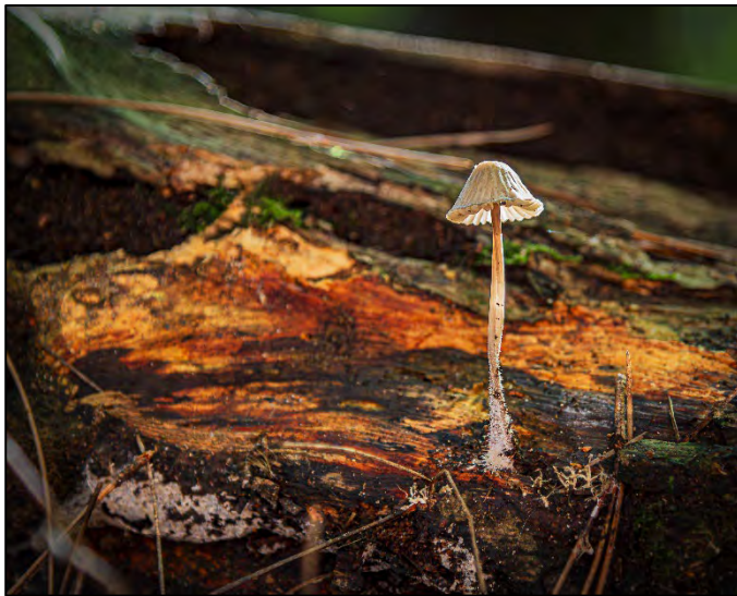
Gravelly Hollow, Calverton in October, photographing fungi