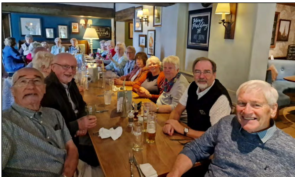
The luncheon club had a well-supported visit to the Hutt in Ravenshead.

The Strollers strolled from Welbeck Garden Centre to Cresswell Craggs and back again for their October stroll, sadly Novembers stroll around Vicar Water was called off because of heavy rain so we strolled from the car park to Rumbles for coffee and bacon cobs!